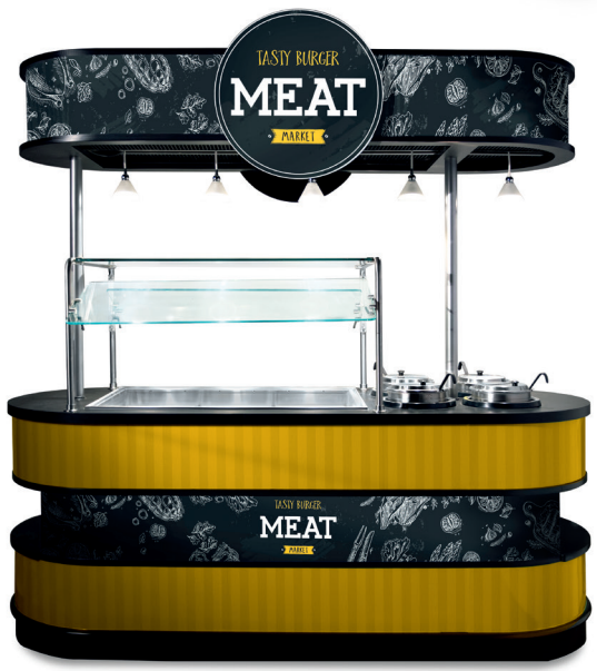
6-Series V-Class Custom Merchandising Carts