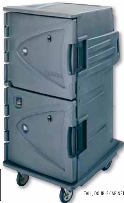
TALL, DOUBLE CABINET