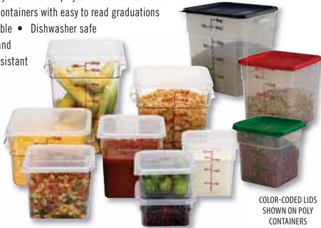
COLOR-CODED LIDS SHOWN ON POLY CONTAINERS